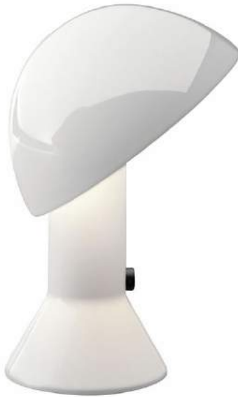
Table lamp indirect light. Adjustable reflector with inside screen made of aluminium painted in white. Molded resin structure in the new golden color. Also available in the series-production colors: white, black, orange, green, yellow, blue. Ruby red for it's 40 anniversary years. The lamp consist of a section of cone base and an adjustable diffuser dome-shaped.

Designed by Elio Martinelli in 1976, Elmetto even though in the design rigour, focuses on the functionality of the use with a large switch in the central body, easy to find in the dark and an adjustable reflector simple to move by the touch of a finger and it allows to shield the light source. A reliable friend, a companion of the evening.