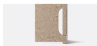
KUNIS BRECCIA STONE

Eave Dining Sofa, Black Steel / Moss 022, by Norm Architects Hashira Table Lamp, by Norm Architects Androgyne Lounge Table, by Danielle Siggerud