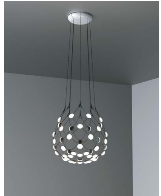
D86C551 weight 2,7 Kg

Reference code: Structure D86C551 1D860C551001 black D86C555 1D860C555001 black