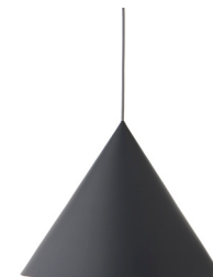
ø30 cm. Matt grey: art.no. 100460 Grey fabric cord