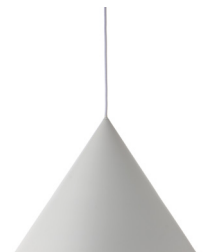
ø30 cm. Matt white: art.no. 100464 ø46 cm. Matt white: art.no. 100546 White fabric cord