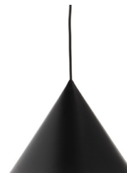
ø30 cm. Matt black: art.no. 100461 ø46 cm. Matt black: art.no. 100542 Black fabric cord