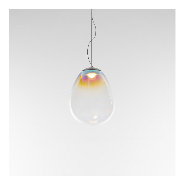
IP20 🖨 🕻 E Dimmerable: +0-