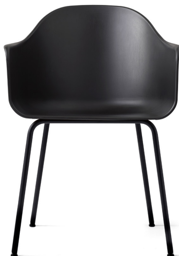
Black Shell / Black Steel Base 9361000