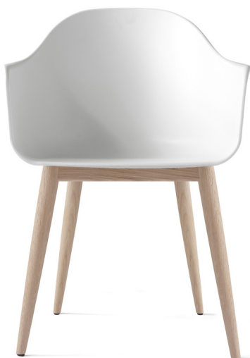
White Shell / Wooden Base 9362000