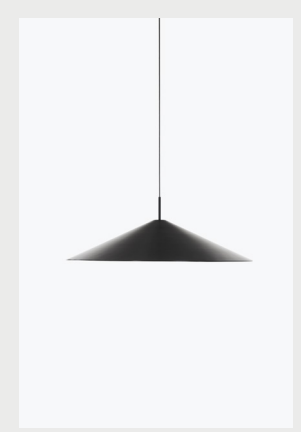
21530/21530US Brolly Pendant Ø90