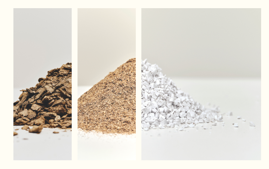
Coffee shells from the coffee roasting process or wooden sawdust from furniture production mixed with industrial plastic waste