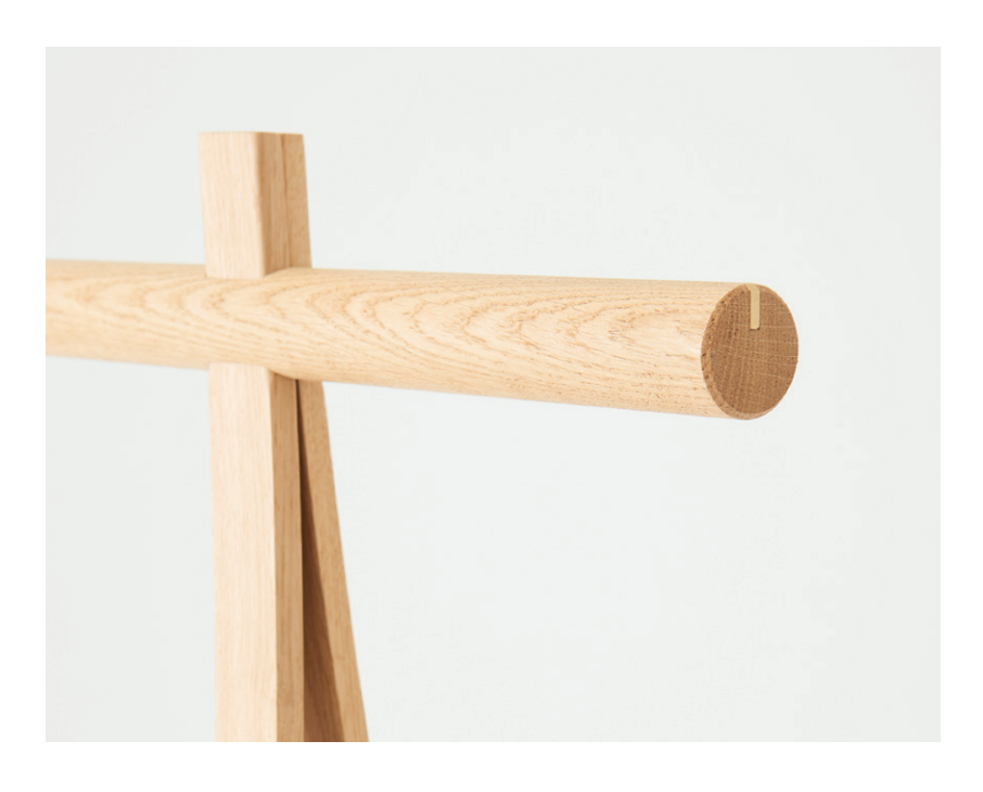
Coat Stand clothing bar with a thin brass detail.