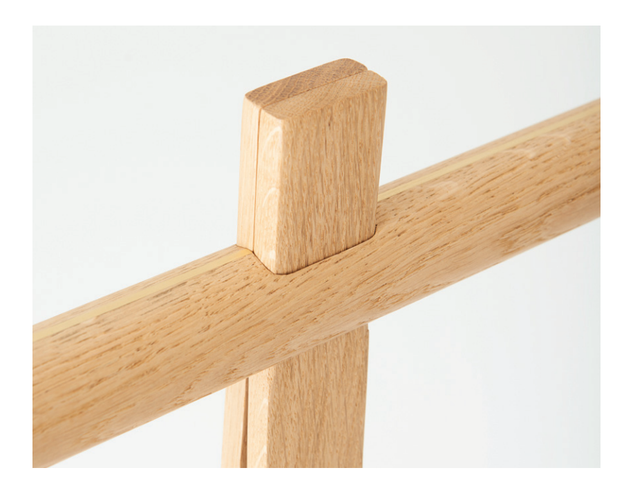
Simple joinery parts at Coat Stand, Oak 150 cm.