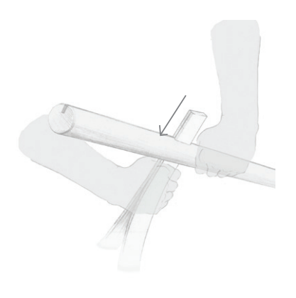
5. Keep the legs(1) pressed together, and insert them into the angled slots in the bar(3).