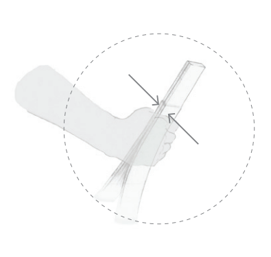
4. Force the top parts of the legs(1) together as shown, to form the arches on the legs.